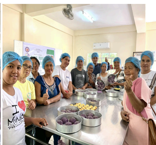
BAKE, BUILD, THRIVE: Sustainable Livelihood Training by Utilizing Local Agricultural By-Products and Product Based-Enterprise for Nagkaisang Gabay sa Bayan ng Gabaldon, Inc.