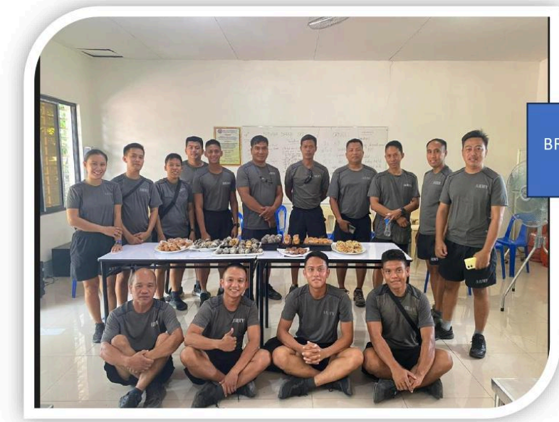
BREAD AND PASTRY TRAINING