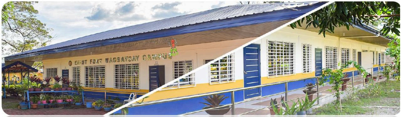
NEUST FMC PROJECT MILITAR