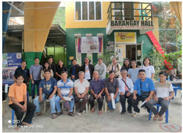
Cultivating Beans of Bliss: Empowering the WADAKA IPs Association through Coffee Production, Primary and Secondary Processing Training & Product-Based Enterprise