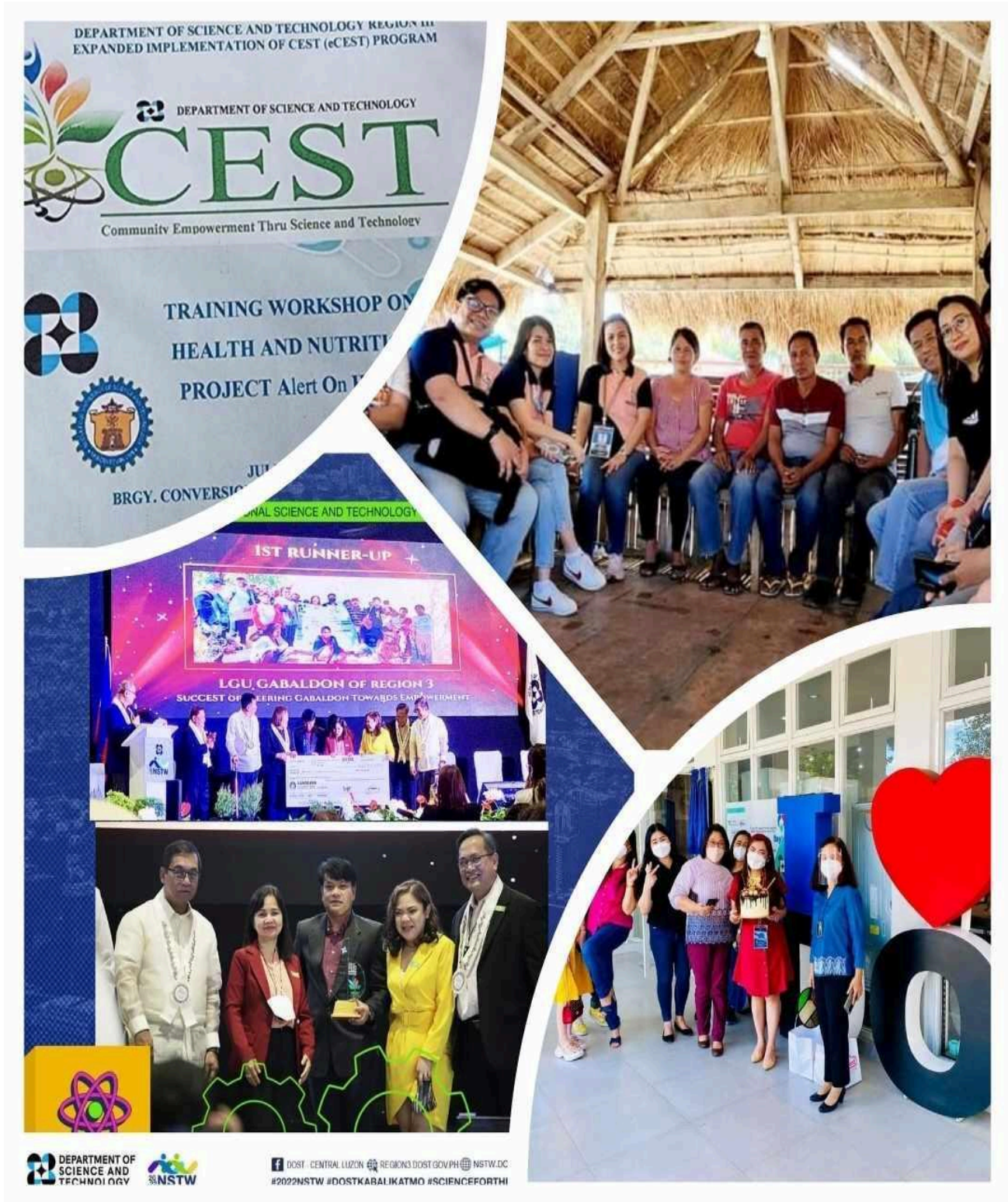
NEUST-CON & DOST CEST Project at Brgy. Conversation, Pantabangan, Nueva Ecija