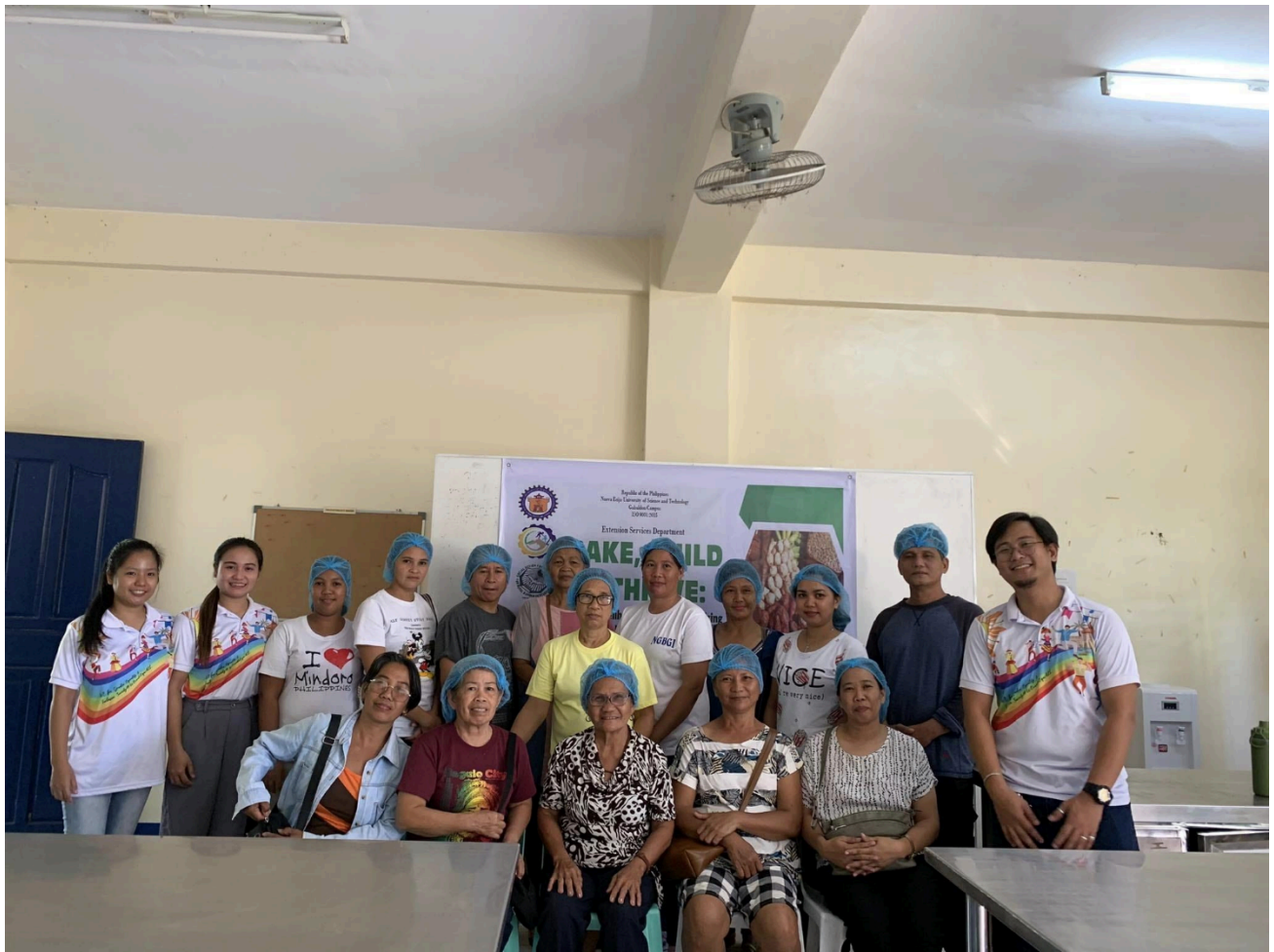
College of Agriculture a. Agro-Ecosystems Sustainable Management and Program for Multi-Cropped Cultivated Areas b. Sustainable Aquatic and Land Resources Enterprises and Coastal Community Development Program