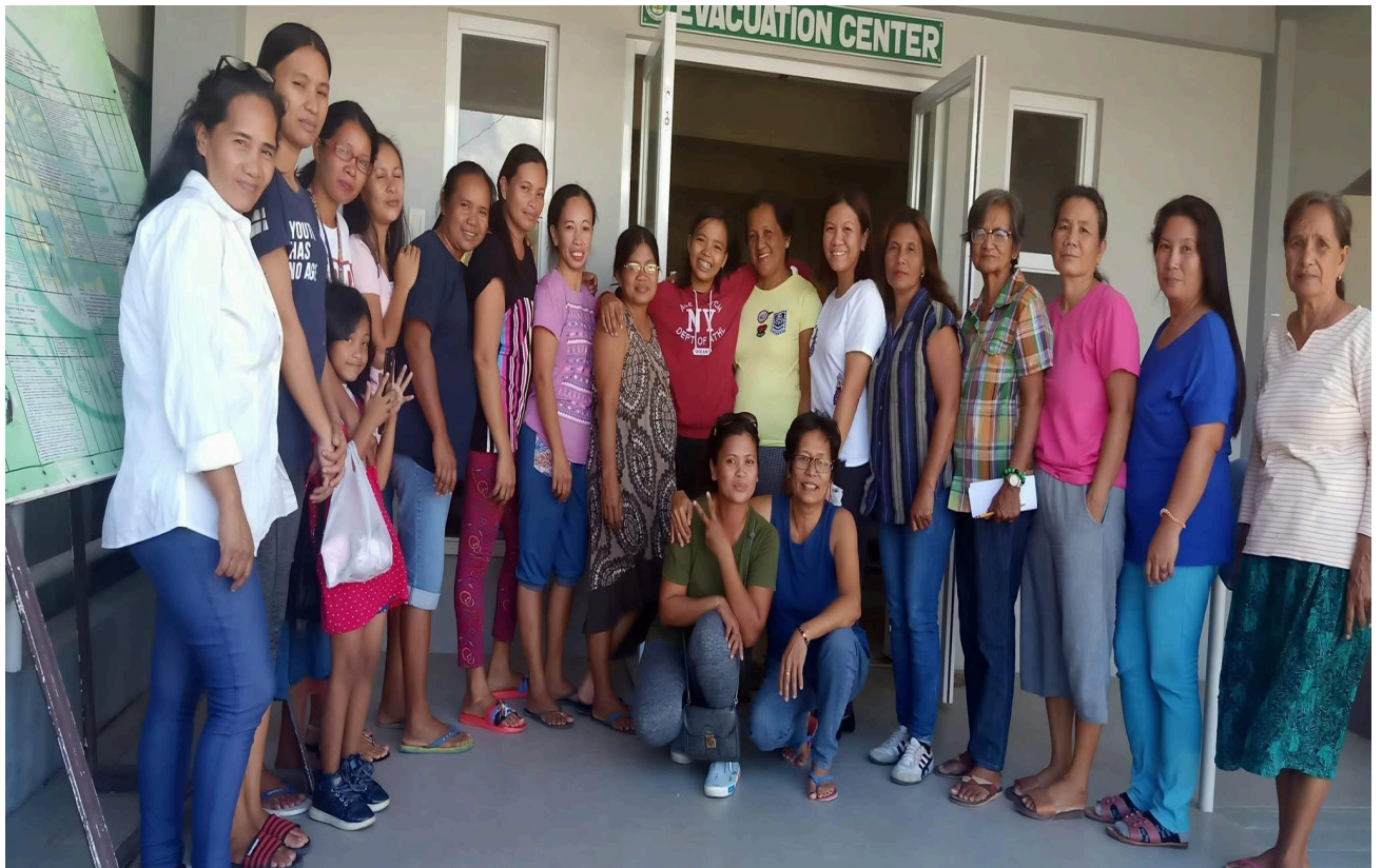
Atate Campus Engagement in Nurturing the Goals of the University thru Action for Men/Women & Youth by Guiding them Towards Development thru Entrepreneurial Extension Services (ENGAGED)