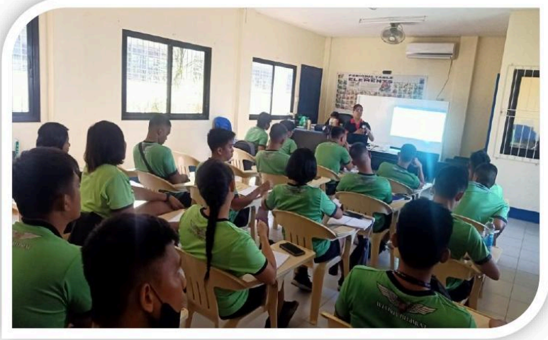
THE MILITARY PERSONNEL OF AVIATION "HIRAYA" REGIMENT DURING THE ARTICLE WRITING TRAINING